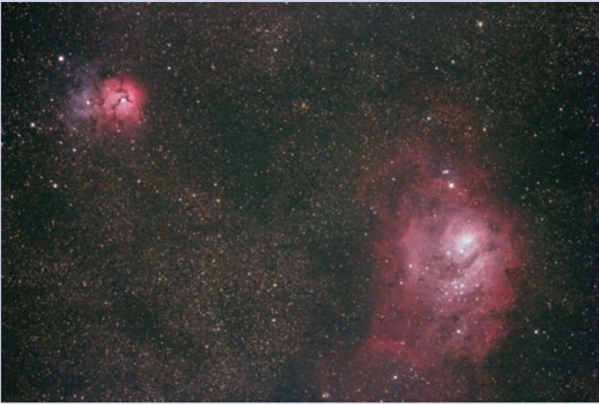
Image 9 - M8 and M20, the Lagoon and Trifid Nebulae, imaged through the Esprit 100ED with a Canon 60Da.