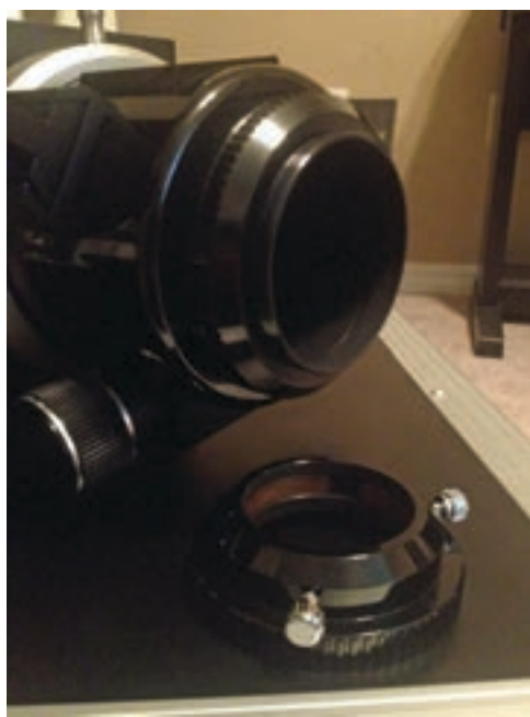
Image 7 - Included step-ring adapter.

After getting back over to my targets, I captured some quick images just as the clouds rolled in. It's been one those summers, where we've had nothing but cloudy nights. I did get enough data to show a really nice, flat field of view. Stars in the corners looked just as beautiful as stars in the center of the field. Vignetting, which was slight, was easily mitigated with flats. The fully illuminated field for this scope is a 40-