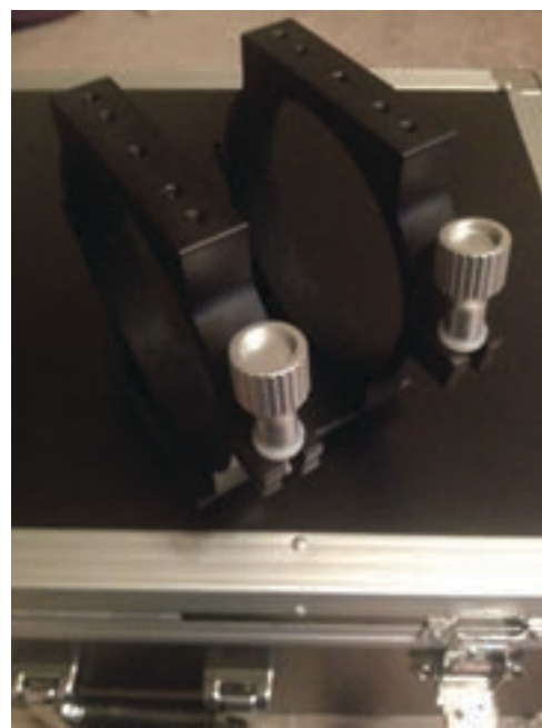
Image 8 - Included heavy-duty split rings.

Weeks later, the weather cleared and I was able to finally get in an entire imaging session. The moon was high, but at this point I couldn't afford to be picky. I chose the NGC 6888, the Crescent Nebula, as my target. I shot an hour's worth of full-color data with the Canon 60Da before deciding to switch over to some narrowband Hydrogen-alpha. The moon was just drowning