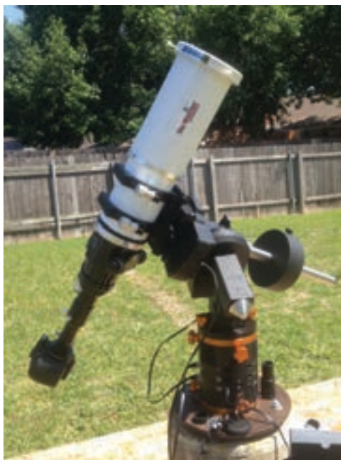
Image 6 - Sky-Watcher Esprit 100ED set up with Kendrick solar filter, field flattener, Tele Vue 2.5x PowerMate and Canon 60Da.

After getting back over to my targets, I captured some quick images just as the clouds rolled in. It's been one those summers, where we've had nothing but cloudy nights. I did get enough data to show a really nice, flat field of view. Stars in the corners looked just as beautiful as stars in the center of the field. Vignetting, which was slight, was easily mitigated with flats. The fully illuminated field for this scope is a 40-