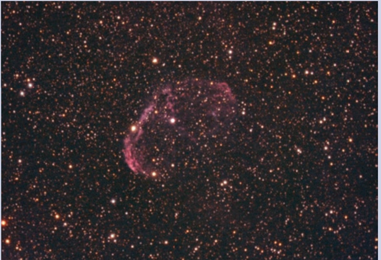
Image 10 - NGC 6888, the Crescent Nebula, full color. The author shot an hour's-worth of full-color data using the Canon 60Da, then two hours through a 6-nanometer Hydrogen-alpha EOS Clip filter from Astronomik, all under a bright Moon.