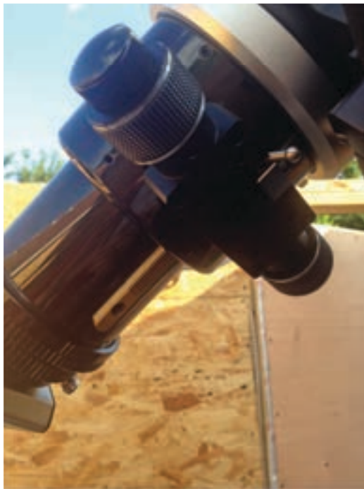
Image 2 - The Esprit 100ED features a deluxe 3-inch rack-and-pinion with sensitive micro-focus functionality and full rotation.