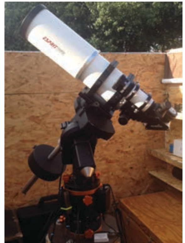
Image 1 - Sky-Watcher Esprit 100ED mounted on the author's Celestron CGE.

The scope did not disappoint. I was immediately blown away by the detail I was detecting in the photosphere. Sunspots were