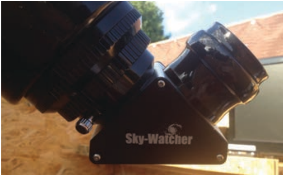
Image 4 - Included 2-inch diagonal with dielectric coatings.