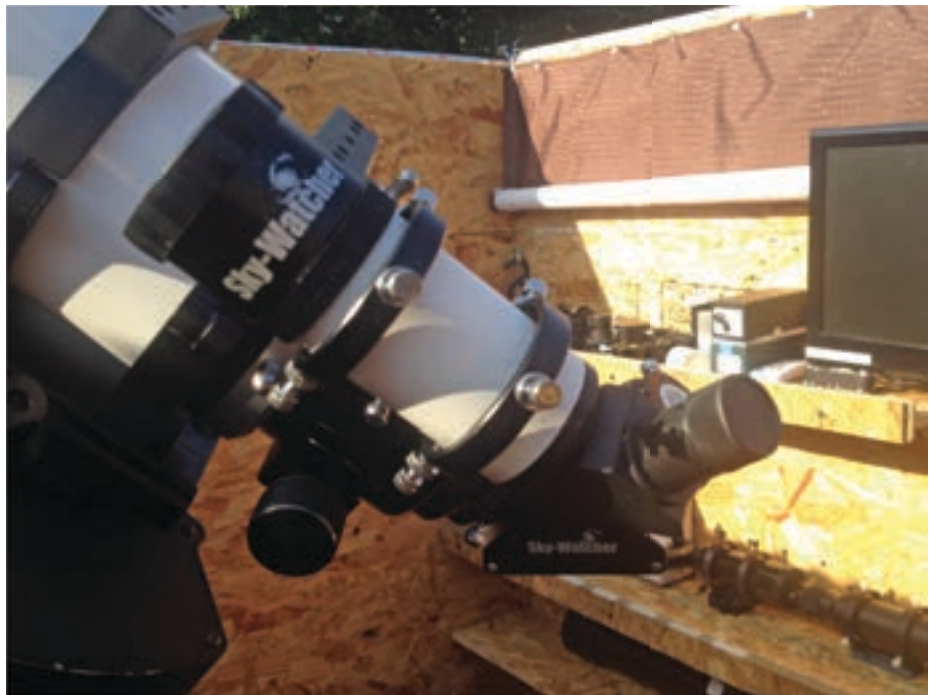
Image 3 - The Esprit 100ED package also includes a 9x50 right-angle, correct-image finder scope.

threaded on the field flattener and attached the Canon 60Da, but didn't have the skies for any serious imaging. What I did notice though, was that the sun was a perfect fit when I added a TeleVue 2.5X PowerMate ( Image 6 ). This meant good things for solar and lunar imaging with this setup. Oh, and the scope just looked so nice on the CGE, outfitted with some imaging gear.