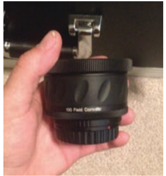
Image 5 - The Esprit 100ED includes a thread-on field flattener.

of view I had with an APS-C sensor like on the Canon 60Da. First, I slewed to a bright star and focused with a Bahtinov mask. The focuser performed perfectly, and the weight of the camera was a non-issue.