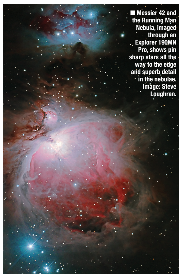
■ Messier 42 and the Running Man Nebula, imaged through an Explorer 190MN Pro, shows pin sharp stars all the way to the edge and superb detail in the nebulae.