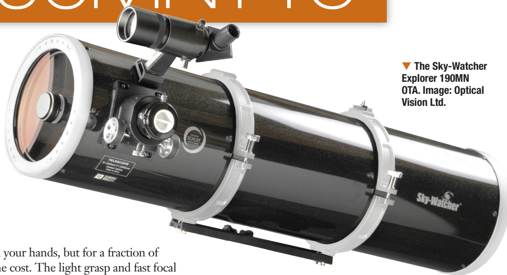
▼ The Sky-Watcher Explorer 190MN OTA.

The question is why, if the Maksutov–Newtonian design can produce optical quality of this level at a remarkable price point, are more companies not doing it? The same question could be levelled at the mount market as well, which Sky-Watcher now deservedly dominates. Sky-Watcher have done their R&D and market research well in both areas, and are adopting very high quality control levels whilst maintaining relatively low costs. With the 190MN they have hit the ground running; the optics on this telescope are truly first class, and whilst there are a few niggles with other aspects, nothing can detract from the fundamental fact that for